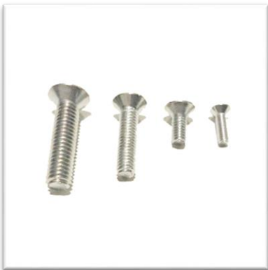
Stainless JF Bolt