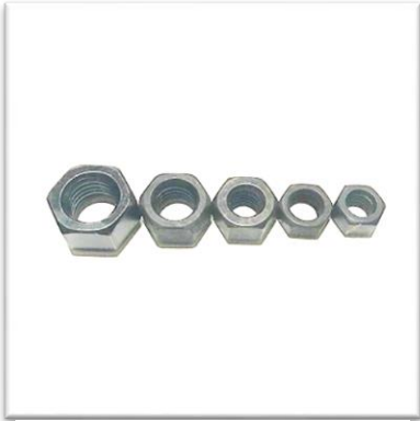
Hitensile Metric Nut