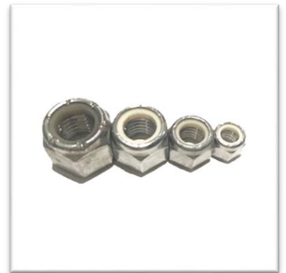
Stainless Locknut Standard Size