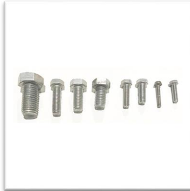
Stainless Hexagonal Capscrew Standard Size