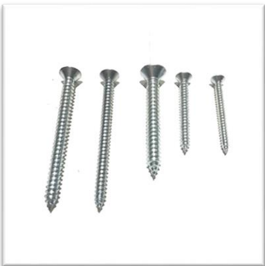
Flathead Metal Screw