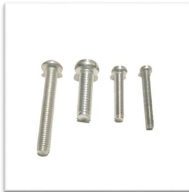
Stainless JP Bolt