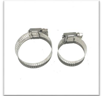
Stainless Hose Clamp