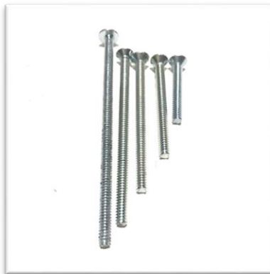
GF Machine Screw