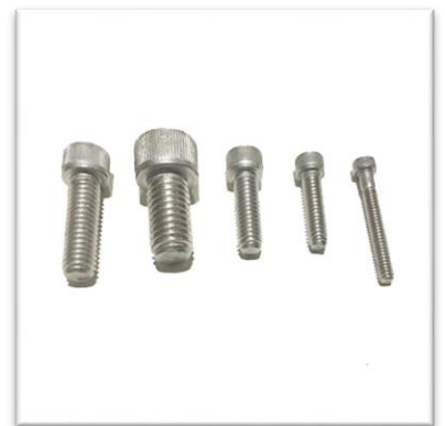
Stainless Standard Size Allen Capscrew