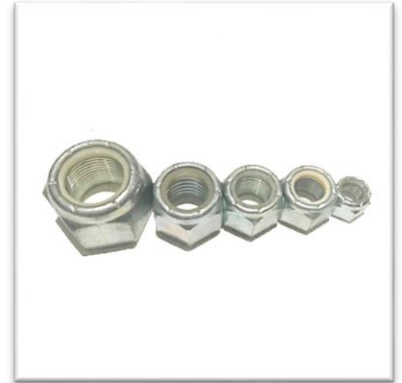
GI Lock Nut Metric Size