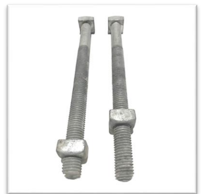
HDG Machine Bolt