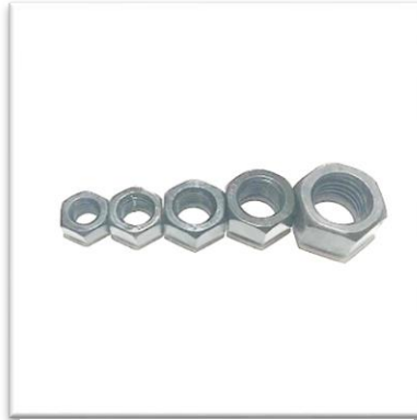
Hitensile Nut Standard Size