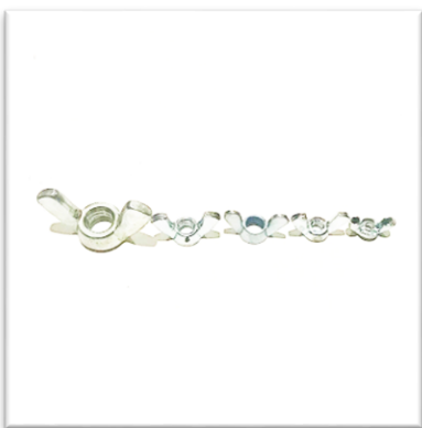
GI Wing Nut