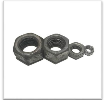
BI Nut Standard Size