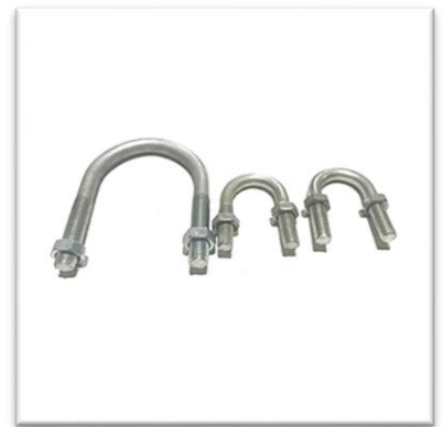
GI U Bolt