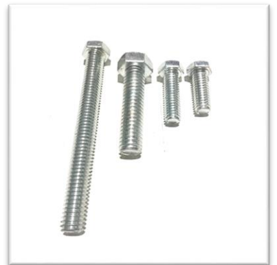
GI BI Bolt