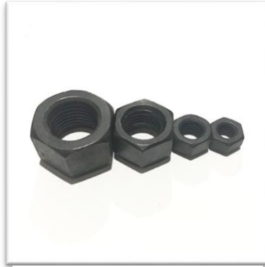
Standard BI Nut