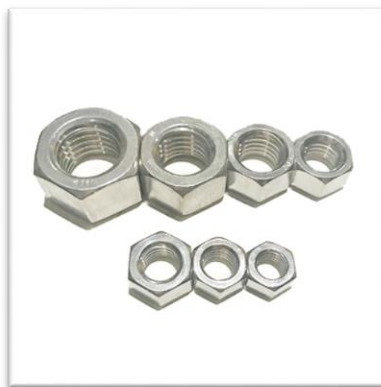
Stainless Standard Nut