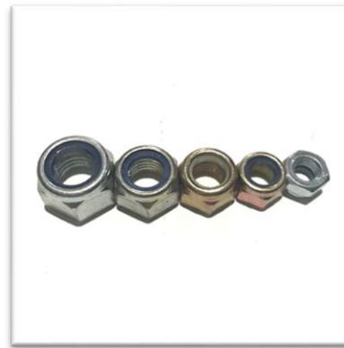
GI Locknut Standard Size