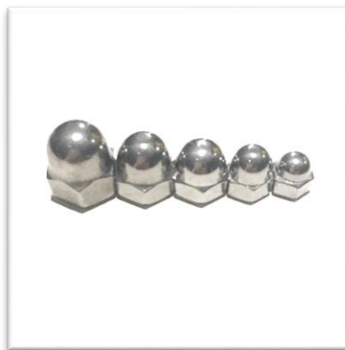
Stainless Cap Nut