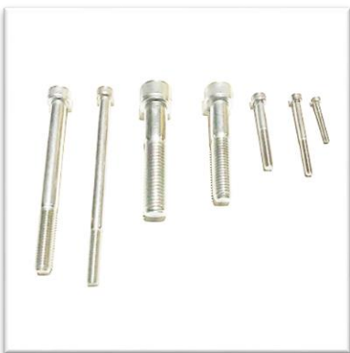
Stainless Allen Capscrew