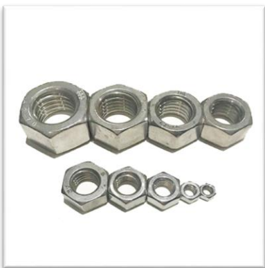
Stainless Metric Nut