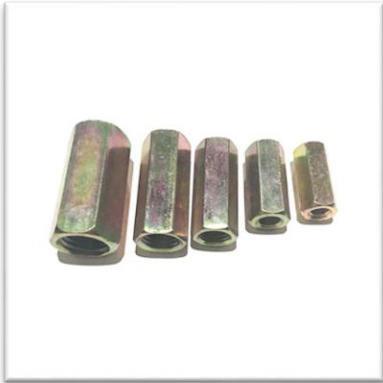
GI Coupling Nut