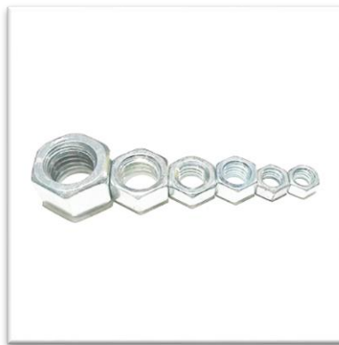
GI Nut Standard Size